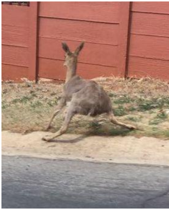
September 2016 - buck got out of reserve, very stressed! Luckily community action and JCPZ follow up, buck put back into reserve