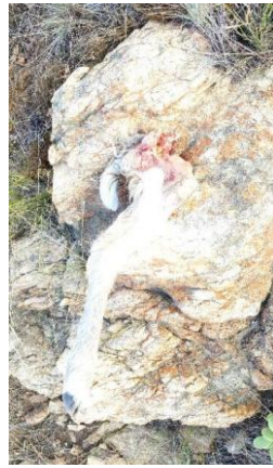
+/- May 2017 Bloody remains of hind quarter of buck found in reserve