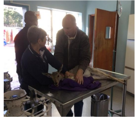
15 July 2017 - dogs attacking buck in Kloofendal parking area , baby buck crashed into fence, had to be euthanized